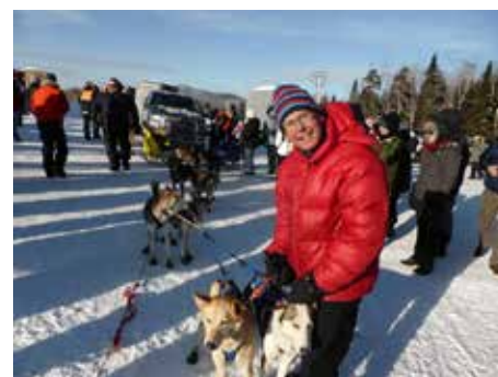
Unidentified Maine Chapter volunteer holds dogs just prior to race start.

AMC staff and volunteers worked together, each in their own tasks, contributing toward another successful race. Despite the cold, snow, and early morning start, the volunteers said they'd be back next year to do it all over again!