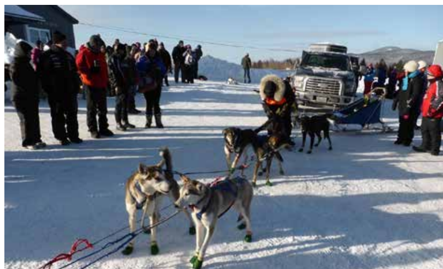
Musher makes last-minute adjustment to dogs' booties before heading to start line.