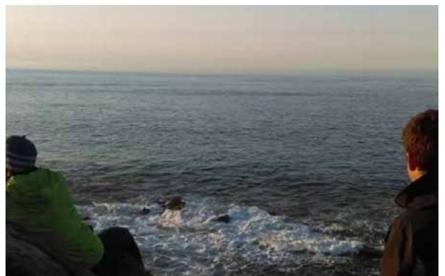
Enjoying the Sunrise on Cutler Coast June 2016

In addition to hikes, socials and other activities, the Young Members have a number of fun camping, hut and backpacking weekends planned for this Spring and Summer. May 19-21 is the Interchapter Young Members Galehead Hut Weekend where you'll get a chance to stay at an AMC Hut and explore the area mountains and trails, June 10-11 we'll be doing a Beginner Backpack along beautiful Cutler Coast, July 21-23 is our 5th Annual Interchapter Rangeley Camping Weekend with hiking and paddling options, and July 29-30 we will be exploring the western side of the Grafton Loop on a 2-day, 1-night backpack. For more activities led by the Maine Chapter Young Members, check out the calendar at www.amcmaine.org and our Facebook page at AMC Maine/NH Young Members. See you on the Trails!