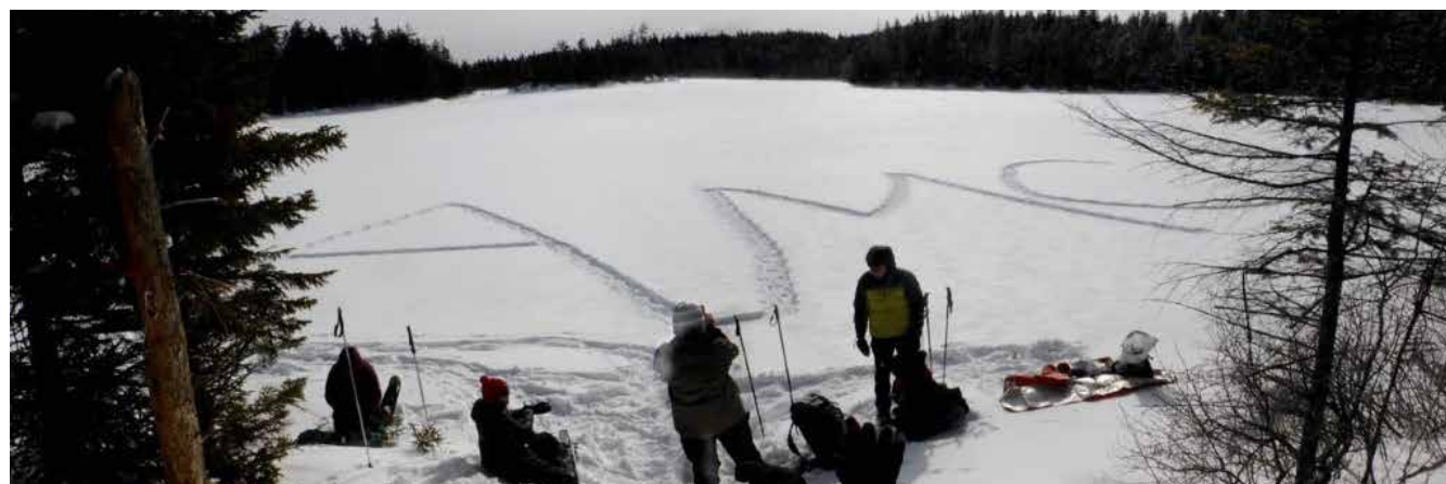
Taking a hike on the newly opened Gorman Lodge Trail, Maine Chapter members have lunch just off the loop trail at West Chairback Pond and decide to 'LEAVE A TRACE'