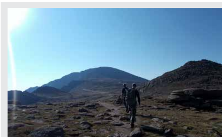
Discovering Colorado. See page 8 for more.