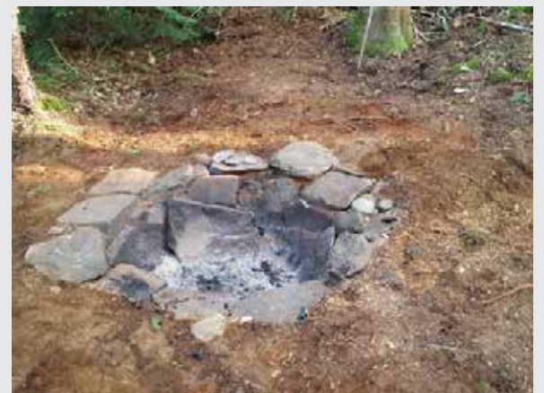
An in-ground rock-lined fire pit is always the focus of island evening "entertainment." See page 8 for more.