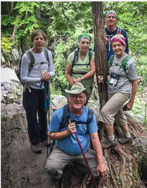
Rest stop and photo op at Little Wilson Falls on the AT section hike Little Wilson Falls to Monson.

Thanks to all the Maine AMC leaders and members who supported the Appalachian Trail Conference in August. Over a dozen Maine Chapter leaders led more than 20 hiking and biking trips and excursions over five days of the conference.