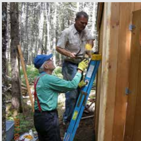
Volunteers building privy for island campsite. See page 8 for more.