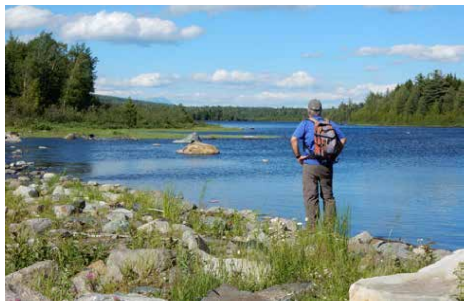
Medawisla - view over Second Road Pond north to Katahdin.

To learn more about AMC's "Maine Woods Initiative" and plan a visit to their Maine Woods Conservation and Recreation Area, go to www.outdoors.org/conservation/maine-woods .