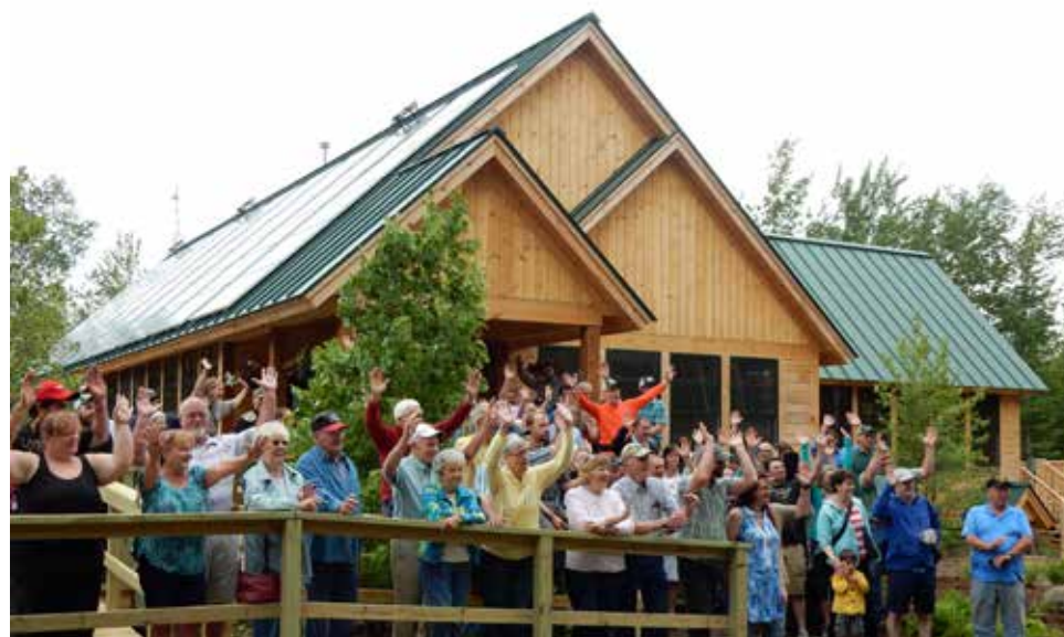
Opening day crowd on Sat, June 24.

The speeches and dedication, the cutting of a big red ribbon, a grand tour of the buildings and grounds, and a huge lunch spread aside, I was really here to check out the trails. So, when the official festivities were through, I headed for