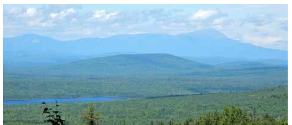
Medawisla - Katahdin view from Shaw Mountain.