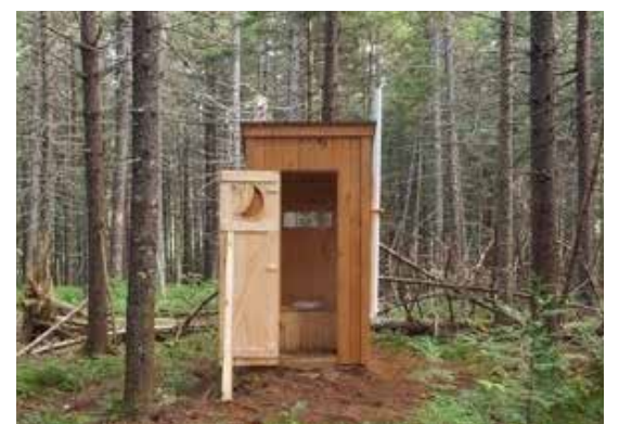
Brand new "facilities" for the new island campsite.

This time they had their work cut out for them. The landing site was covered in alders and fallen trees, impassable except for the most intrepid. Potential sites for tents, table, and fire pit were similarly covered in long-dead trees resembling a life-size version of pick-up sticks. The privy location was but a fluorescent-flagged single stick placed by the Maine state soils engineer during an earlier scouting visit. Nothing looked easy.