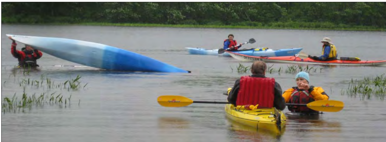
Maine Chapter members practice wet exits (a.k.a. falling out of your kayak) at the Sea Kayak Rescue Workshop on June 6, 2010.

Let's meet in Yarmouth and do the Audubon ride. This ride is about 15 miles to Gilsland Farm to see