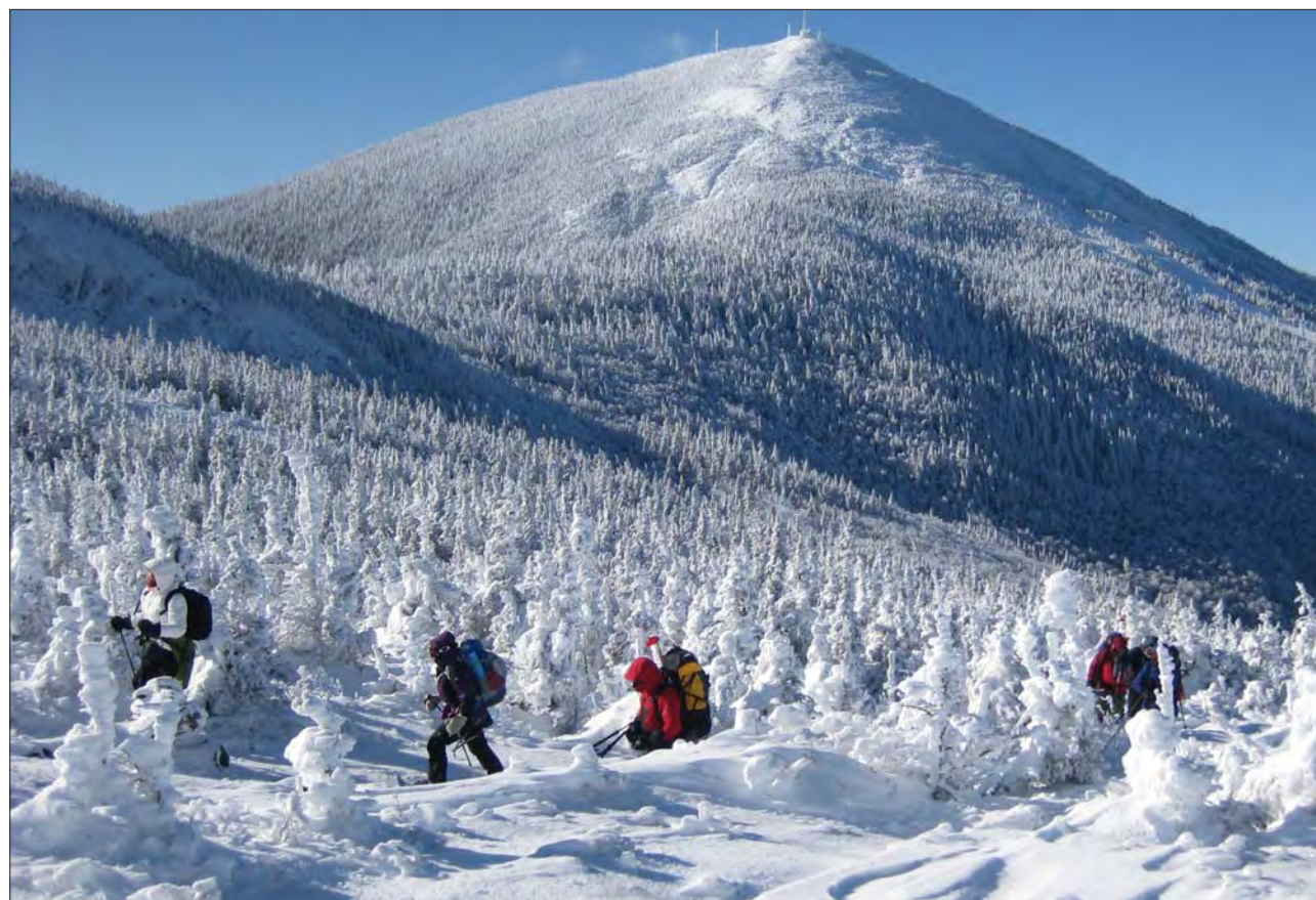
Above: Maine Chapter hikers break out of treeline on Burnt Mountain in January 2010 with Sugarloaf in the background. Left: Mount Washington Observatory.