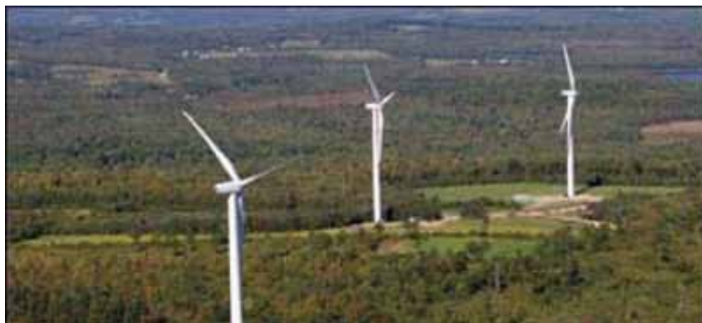
View of Beaver Ridge Wind in Freedom, Maine