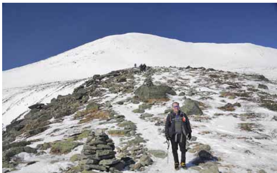
Maine members descend the Lion's Head Trail with the Mount Washington summit behind on March 19, 2011.